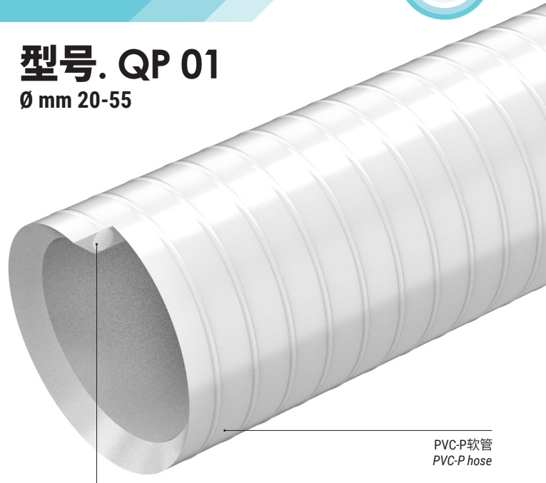
PVC-P软管 PVC-P hose